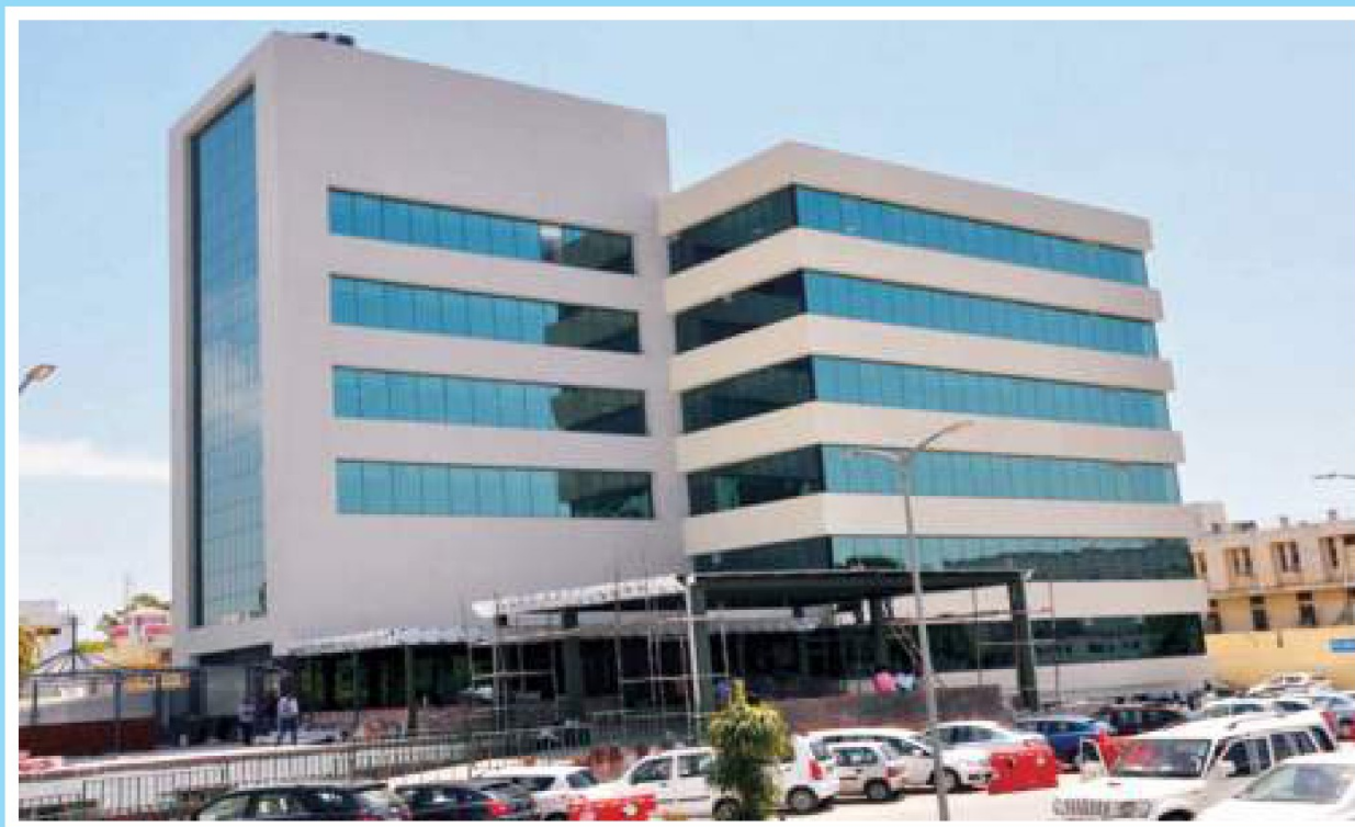
CANCER CARE CENTRE