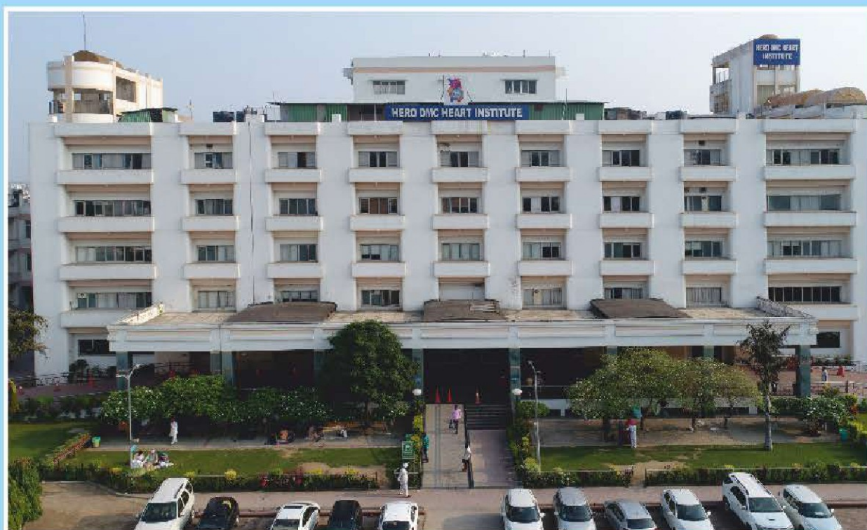
HERO DMC HEART INSTITUTE