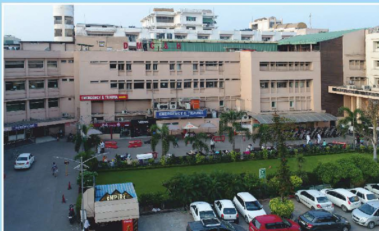
DAYANAND MEDICAL COLLEGE & HOSPITAL