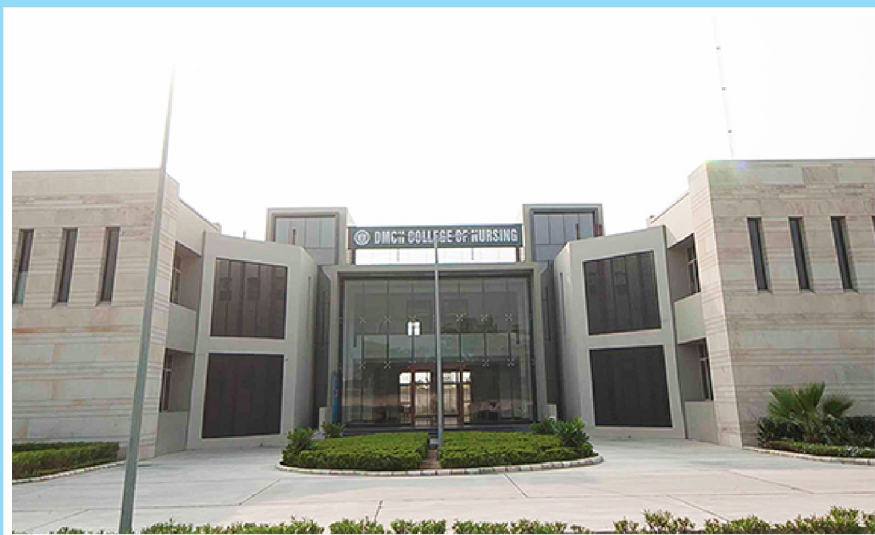
COLLEGE OF NURSING