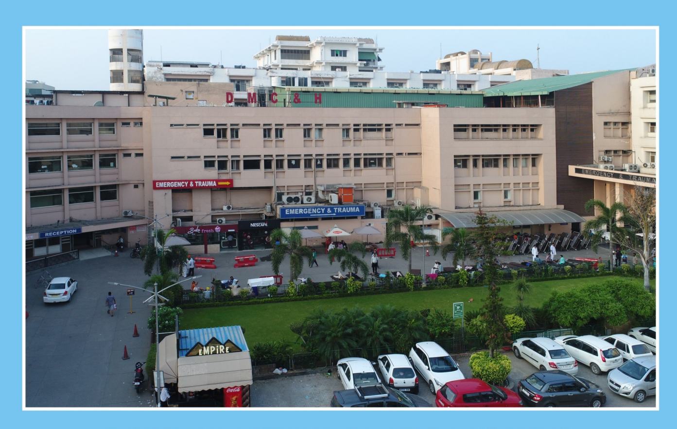
DAYANAND MEDICAL COLLEGE & HOSPITAL