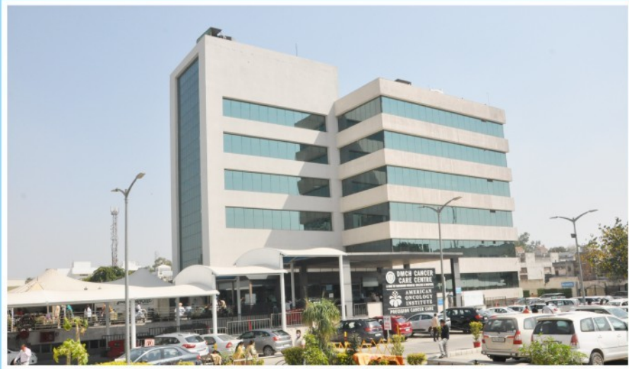
STATE OF THE ART - CANCER CARE CENTRE