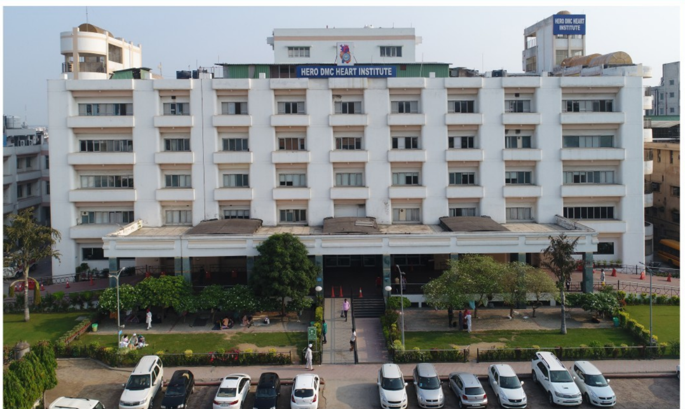
UNIT-HERO DMC HEART INSTITUTE